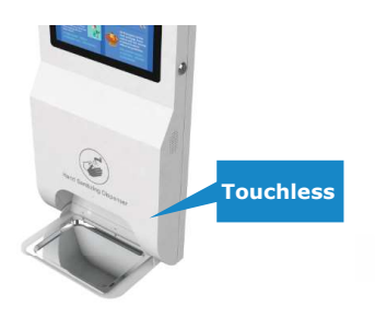
Auto dispensing function

21.5 inch Hand Sanitizing Dispenser support both VESA wall mount and floor standing installation. Auto dispensing functionality, convenience use for anyone in any public space. Help keeping your hands clean and safe for everyone.